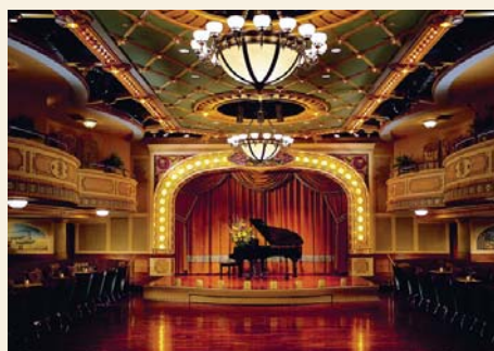
The Grand Saloon - A recreation of Ford's Theater

Book Early and enjoy complimentary shore excursions in every port! A remarkable added value to an already comprehensive holiday!