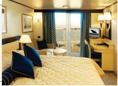
approx. 248 square feet as pictured (A1-A7)

24-hour room service. two beds that convert to a queen, refrigerator, safe, hair dryer, bathrobe & slippers, nightly turn-down service, satellite TV, Bon Voyage half bottle of sparkling wine upon embarkation, and more.