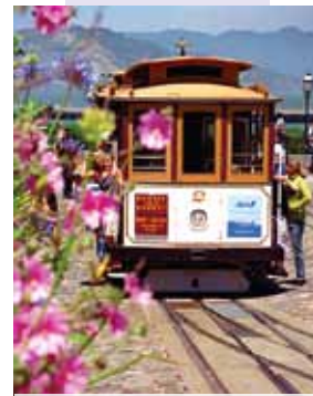
San Francisco Cable Cars

An upgrade to larger Superior Double Bedrooms on the train is available for $250 pp additional. Guests wishing added savings may subtract $200 pp for travel in classic Pullman Sections.