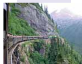
White Pass & Yukon RR