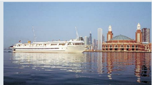
A convenient departure right from Chicago's Navy Pier! (sister-ship Niagara Prince pictured)