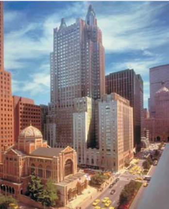
The Iconic Waldorf-Astoria, Park Avenue.

NEW YORK CITY, NY: The Grande Mariner sails down the Hudson River midday, under the George Washington Bridge to dock in midtown Manhattan in Chelsea. We transfer to the opulent Waldorf-Astoria for our overnight stay in the Big Apple with a special Farewell Dinner this evening. We offer low-cost air or train travel fares home from New York City for added convenience or guests may extend their stay in New York City.