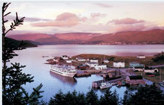
Sunset on the Great Lakes, we sail where the big ships simply cannot.