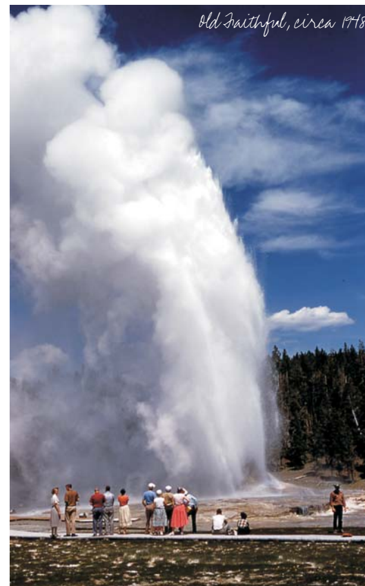
Old Faithful, circa 1948

We cross the Mississippi River after breakfast and are soon speeding through the rich farmland of Illinois bound for Chicago with an afternoon arrival in the Windy City. West Coast guests will cross the Sierra Nevada mountain range this morning for an afternoon arrival in Sacramento and the Bay Area.