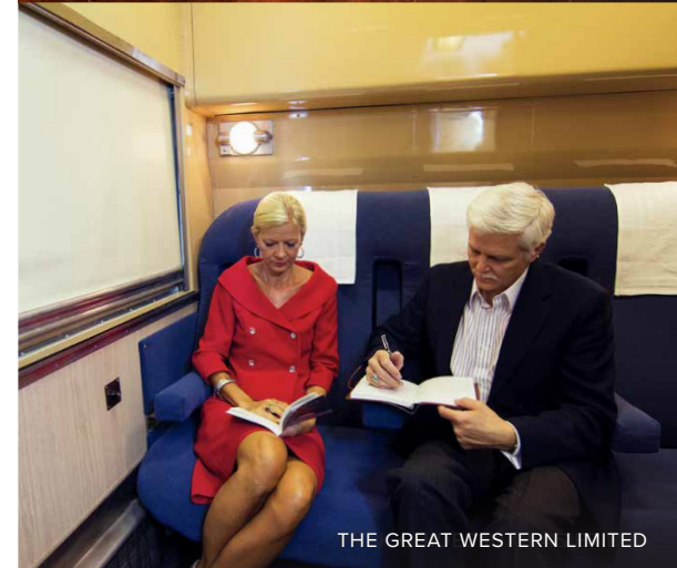
THE GREAT WESTERN LIMITED