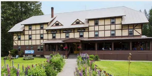
IZAAK WALTON INN Essex, MT

The Izaak Walton Inn is a historic train-themed inn in Essex, Montana, originally built by the Great Northern Railway in 1939 for lodging railway workers. In addition to railway lodging, the hotel was also originally envisioned to become an official southern gateway to Glacier National Park, although that plan didn't come to fruition. The charming Tudor Revival inn was added to the National Register of Historic Places in 1985. Interestingly, in addition to the rooms within the inn itself, some refurbished cabooses are also offered and available on most dates upon request at a higher rate.