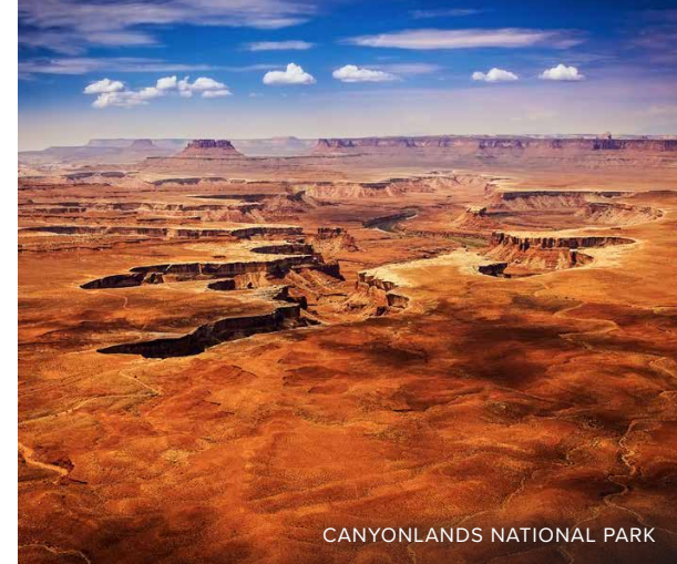
CANYONLANDS NATIONAL PARK