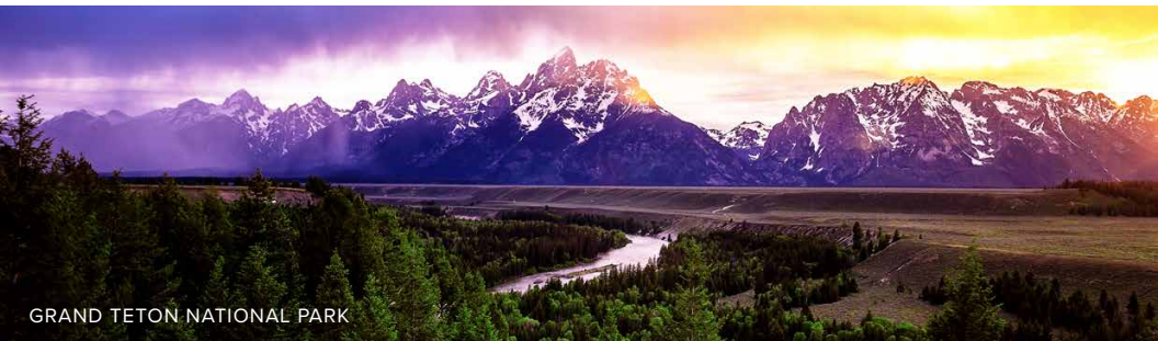
GRAND TETON NATIONAL PARK

UNCOMMON JOURNEYS | DISCOVER WHAT MOVES YOU