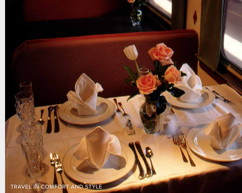
TRAVEL IN COMFORT AND STYLE

PROFESSIONAL TOUR MANAGER | Uncommon Journeys holidays are always fully hosted by a professional tour manager from start to finish to handle all the details and make your dream vacation the trip of a lifetime.