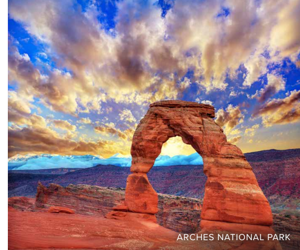
ARCHES NATIONAL PARK