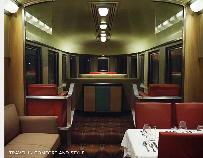
TRAVEL IN COMFORT AND STYLE

PROFESSIONAL TOUR MANAGER | Uncommon Journeys holidays are always fully hosted by a professional tour manager from start to finish to handle all the details and make your dream vacation the trip of a lifetime.