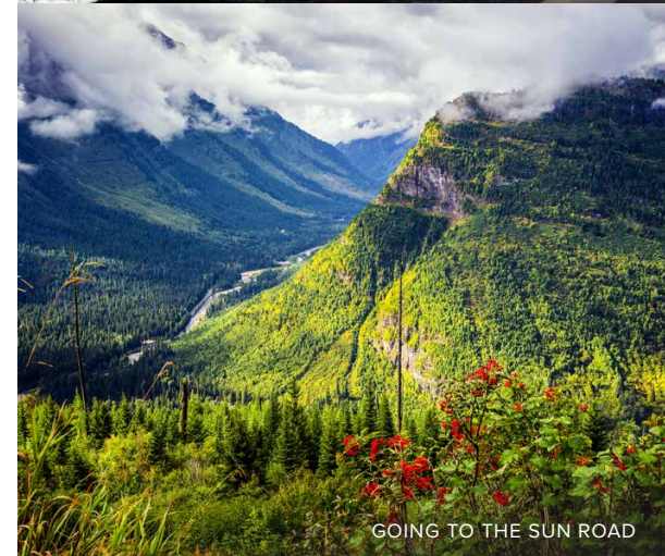
GOING TO THE SUN ROAD