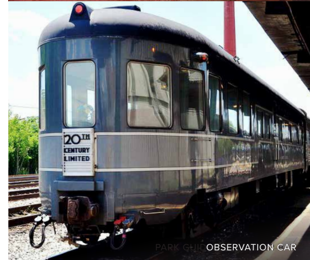
PARK GHI OBSERVATION CAR