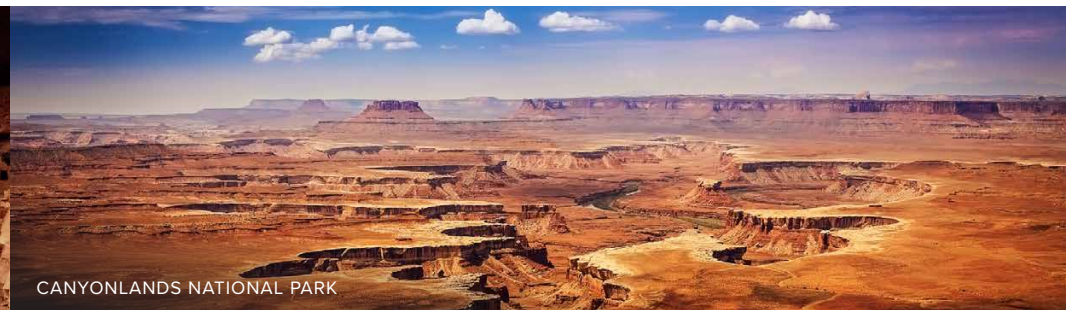
CANYONLANDS NATIONAL PARK

UNCOMMON JOURNEYS | DISCOVER WHAT MOVES YOU