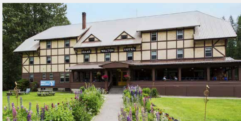
IZAAK WALTON INN Essex, MT

The Izaak Walton Inn is a historic train-themed inn in Essex, Montana, originally built by the Great Northern Railway in 1939 for lodging railway workers. In addition to railway lodging, the hotel was also originally envisioned to become an official southern gateway to Glacier National Park, although that plan didn't come to fruition. The charming Tudor Revival inn was added to the National Register of Historic Places in 1985. Interestingly, in addition to the rooms within the inn itself, some refurbished cabooses are also offered and available on most dates upon request at a higher rate.