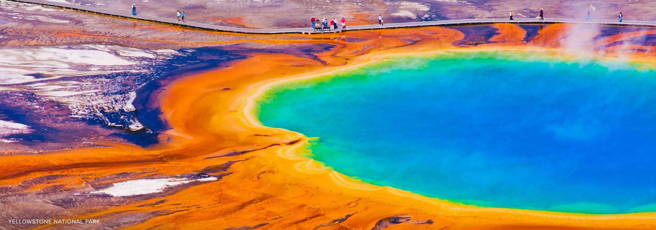
YELLOWSTONE NATIONAL PARK