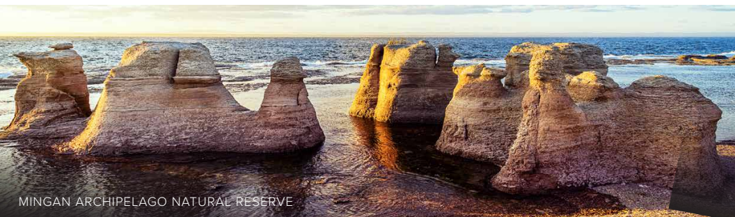
MINGAN ARCHIPELAGO NATURAL RESERVE

Lawrence River calling at Quebec City, Baie-Comeau and Havre-Saint-Pierre before the highlight of your holiday – three ports in Newfoundland: Corner Brook, St Anthony and St Johns, giving you up close views of this ruggedly beautiful Province including glorious Gros Morne National Park, a UNESCO World Heritage Site. Then it's onward to historic Halifax and tony Bar Harbor before concluding your voyage in Boston. With a fabled train, a highly rated Dutch Ocean Liner and a superlative itinerary, we invite you to join us as we know this uncommon journey will sell out quickly. All Aboard!