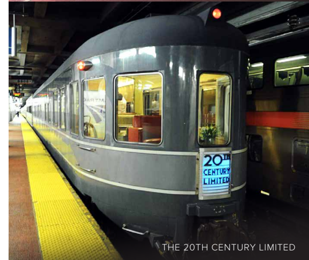
THE 20TH CENTURY LIMITED