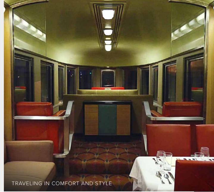
TRAVELING IN COMFORT AND STYLE

NEW YORK CENTRAL TAVERN LOUNGE CAR | Among the legendary trains that once crossed the United States, the grandest and most fabled of all was the 20th Century Limited between New York and Chicago over the New York Central Railroad. This showcase operation with its celebrities, film stars and Royalty was the standard by which every other great train was judged and this continued well into the 1960's. In 1948, in Grand Central Station, a postwar 20th Century Limited was inaugurated by Dwight Eisenhower and the actress Beatrice Lillie. Its greatest and most famous car was the round end of train Observation Car, the Hickory Creek, with a stepped down Observation Room featuring some of the biggest windows ever put in a train, a smart art deco interior and elegant furnishings. Happily this car has survived and now, lovingly restored, will be one of two vintage rail cars on this passage to Newfoundland. Along with Hickory Creek is a former New York Central running mate, a tavern lounge car with comfortable seating, authentic décor and a separate tavern area. With a welcoming staff and enticing amenities like mimosas, Afternoon Tea and smart cocktail hours, this car is as much a treat today as in the 1950's when it was assigned to crack trains like the Pacemaker and Commodore Vanderbilt . Only one company offers a holiday package this special, unique and distinctive – Uncommon Journeys.