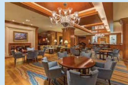
LITTLE AMERICA HOTEL - SALT LAKE CITY