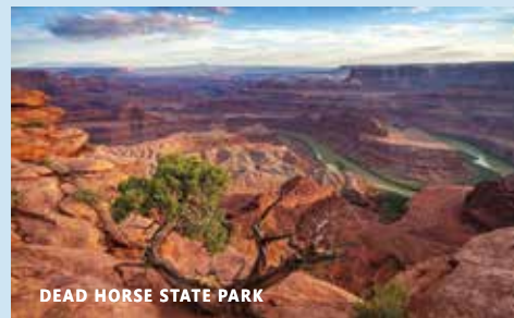
DEAD HORSE STATE PARK