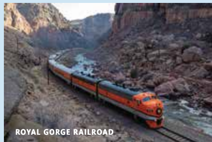
ROYAL GORGE RAILROAD