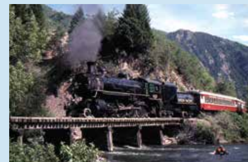
HEBER VALLEY RAILROAD

Salt Lake City, Little America Hotel Moab, Hyatt Place ( or similar ) Glenwood Springs, Hotel Colorado Colorado Springs, Hyatt Place ( or similar )