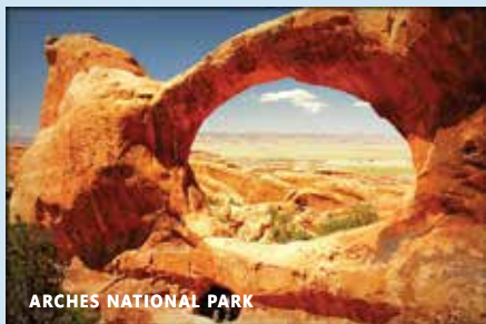
ARCHES NATIONAL PARK

Springs. This train trip is legendary, traveling along the Colorado River and through Glenwood Canyon and through the Rockies in supreme comfort in big-windowed cars and every creature comfort onboard. Upon arrival in Denver, we transfer to lovely Colorado Springs for a three-night stay where more stunning vistas await, from the spectacular Garden of the Gods to the famed Pikes Peak Cog Railway to the top of Pikes Peak. We also visit the impressive US Air Force Academy and enjoy a trip through the Royal Gorge over the Royal Gorge Railroad. With fine hotels, great dining, transportation, all transfers and complete sightseeing, this is one of our nicest western holidays ever. All Aboard!