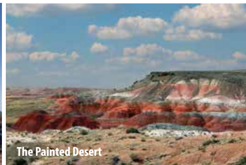
The Painted Desert