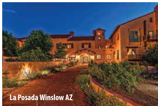
La Posada Winslow AZ