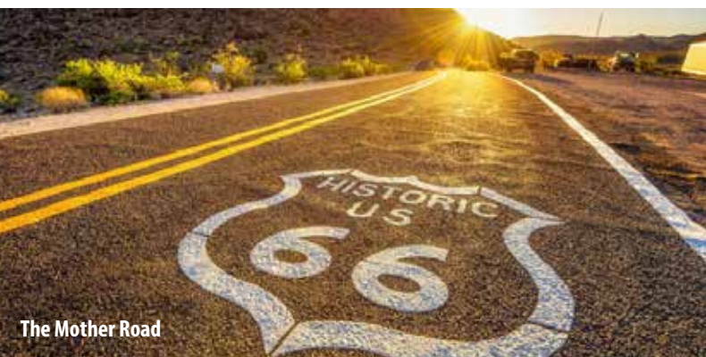
The Mother Road

A 35% deposit of the Total Fare is required to confirm reservations aboard any tour or program. After 5 days, confirmed reservations without deposit will be automatically cancelled by our reservation system. Final Payment is due 120 days prior to the departure date. Payment by American Express, VISA, MasterCard, Discover Card, or check is accepted.