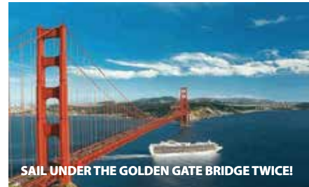
SAIL UNDER THE GOLDEN GATE BRIDGE TWICE!