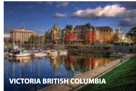
VICTORIA BRITISH COLUMBIA