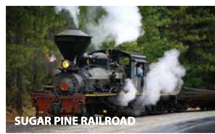
SUGAR PINE RAILROAD

Day 12: Royal Princess arrives in beautiful Vancouver this morning and guests disembark after breakfast, either traveling home by train or air or extending their stay in the Pacific Northwest.