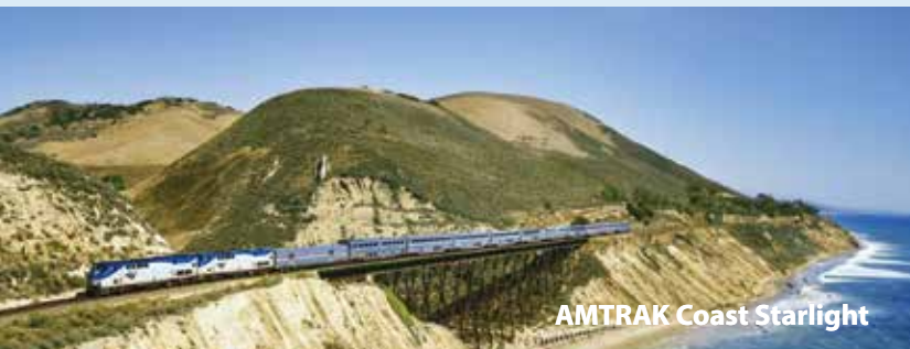
AMTRAK Coast Starlight