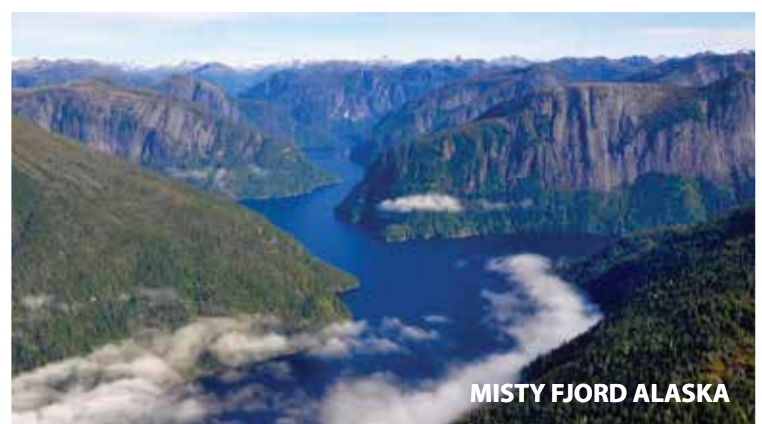
MISTY FJORD ALASKA

This holiday is elegantly planned with fine hotels, some exceptional dining, intelligent included sightseeing with all admission fees and a professional tour manager. The only serious shortcoming to this vacation will sell out quickly and prompt reservations are encouraged to avoid disappointment. All Aboard!