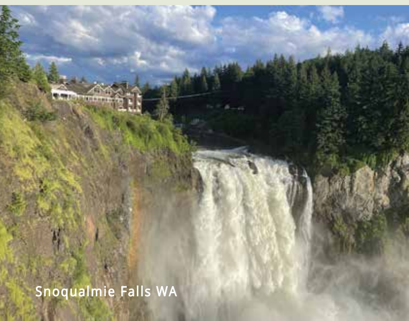
Snoqualmie Falls WA