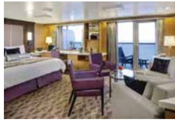
Neptune Suite $6,795 DBL $10,795 SNG