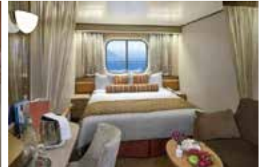
Oceanview $3,695 DBL $4,695 SNG