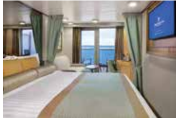
Veranda $3,995 DBL $5,995 SNG