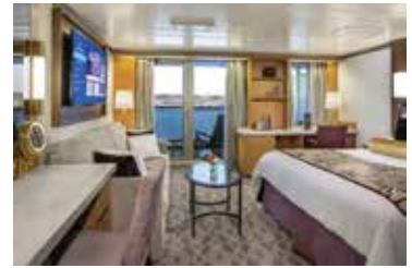
Signature Suite $4,995 DBL $7,495 SNG