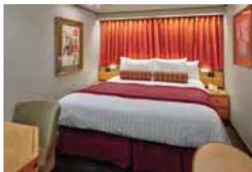
Inside $3,495 DBL $4,295 SNG